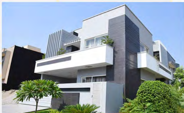
FAISAL VILLAS, FAISAL TOWN (FT) MAIN FATEH JANG ROAD, N-80, RAWALPINDI