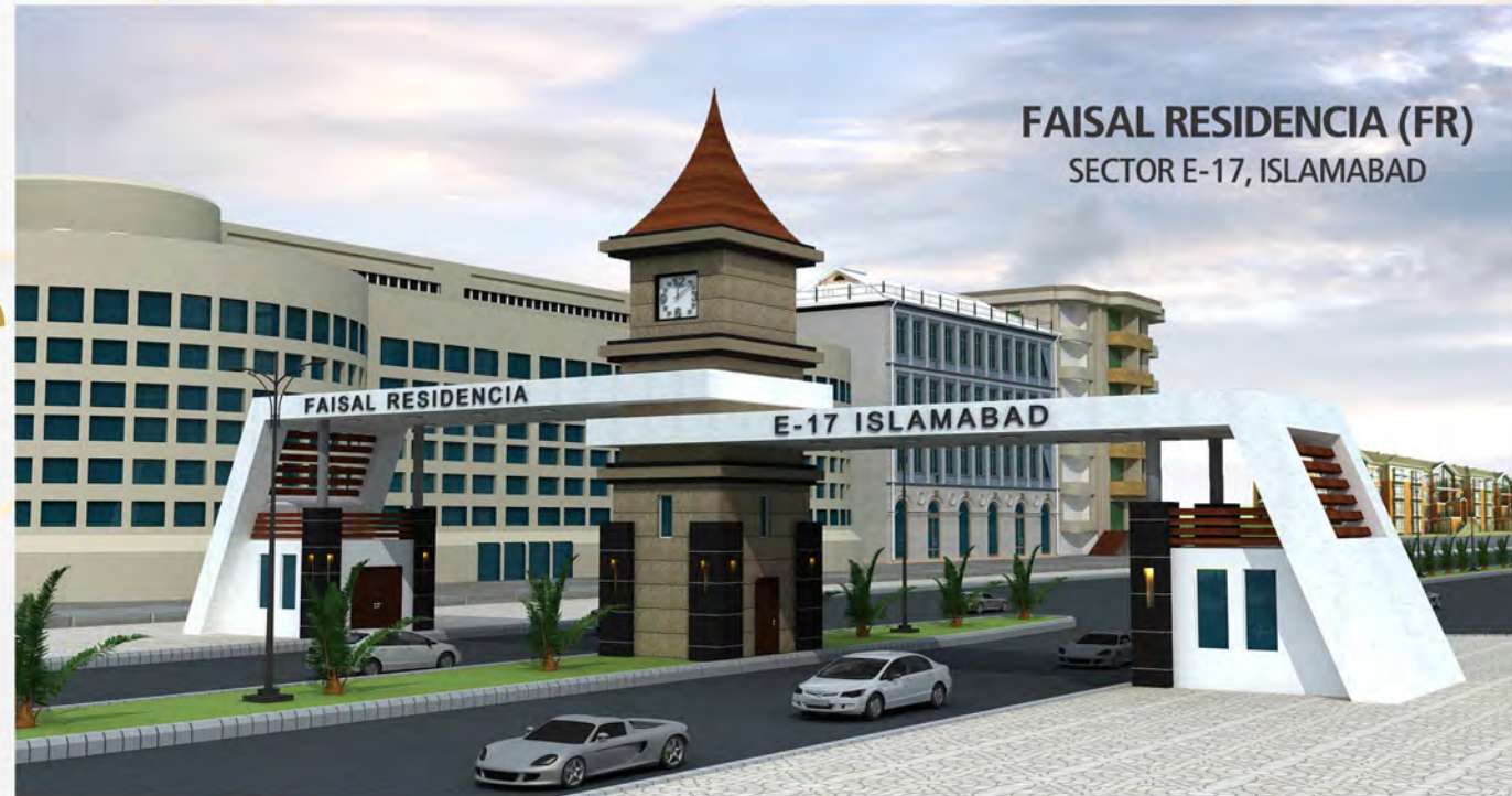
FAISAL RESIDENCIA (FR) SECTOR E-17, ISLAMABAD