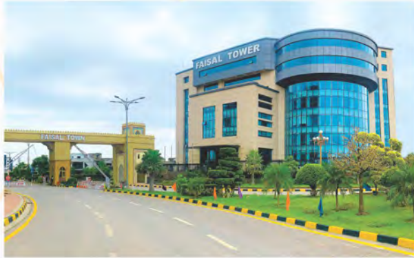
FAISAL TOWN (FT) MAIN FATEH JANG ROAD N-80, RAWALPINDI