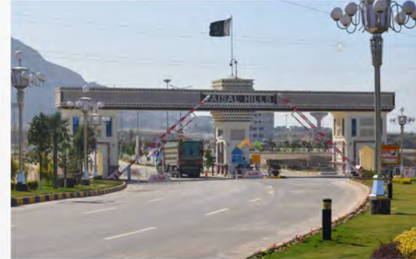
FAISAL HILLS (FH) MAIN G.T ROAD N-5, TAXILA RAWALPINDI