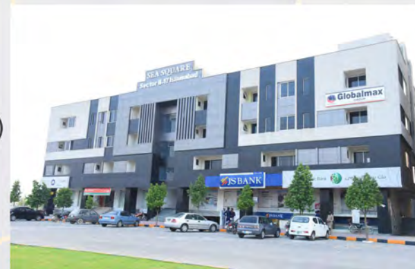
SEA SQUARE SECTOR B-17, ISLAMABAD